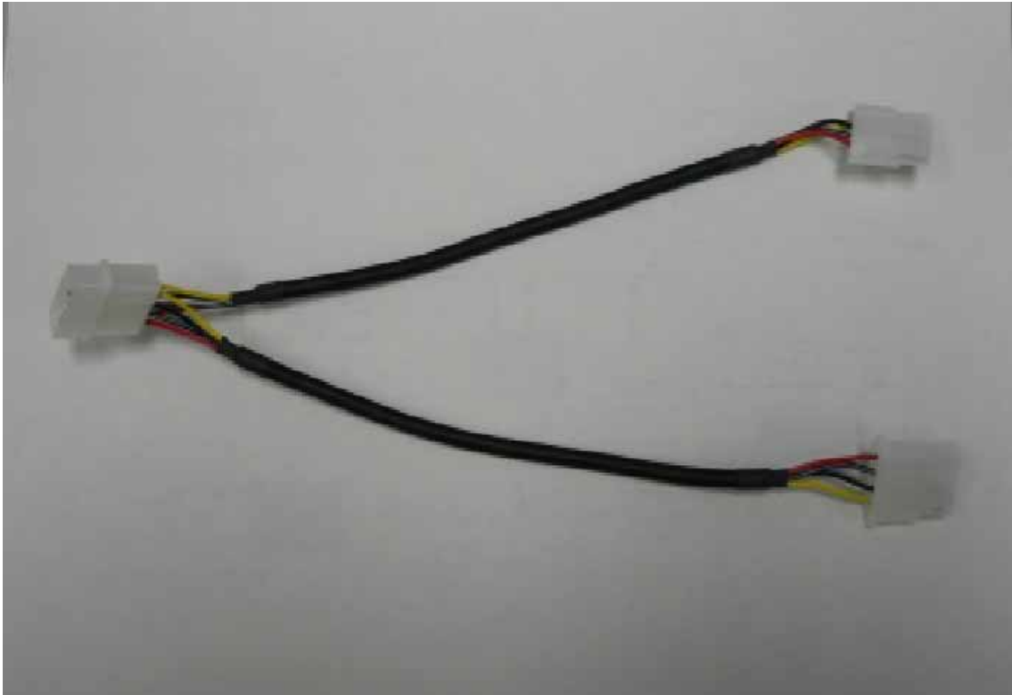
2. . Power supply from ATX POWER